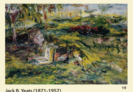
In Tir Na nÓg, 1936 Oil on canvas

great tales and adventures. The emotional intensity of the painting is conveyed through its rich colours, most notably the combination of blues and greens, a favourite mixture in Yeats's paintings of the 1930s. The rich and varied application of pigment creates a capricious surface, full of movement and life. It emphasizes the tenuous position of the main figure, the youth, whose enjoyment of real and imagined form is only temporary. There is a suggestion that the pulsating landscape and myths will continue after he has gone. But the physicality of the vigorous brushwork and the power of the colour takes precedence over the narrative, forcing the viewer to engage in the sheer exuberance of the construction of the painting itself and its effects."