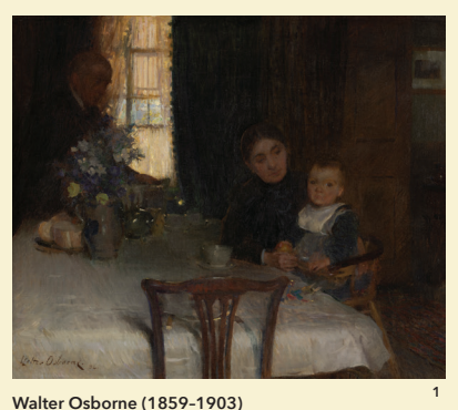
At the Breakfast Table, 1894 Oil on canvas