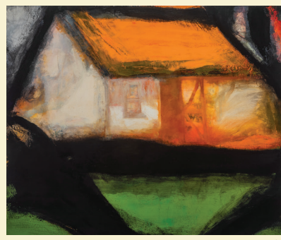
Hughie O'Donoghue (1953-) Revolution Cottage, 2015 Oil on canvas